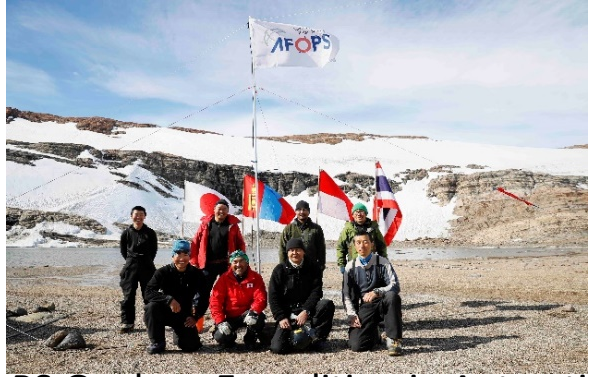
AFoPS Geology Expedition in Antarctica - AGEA 2016/17-