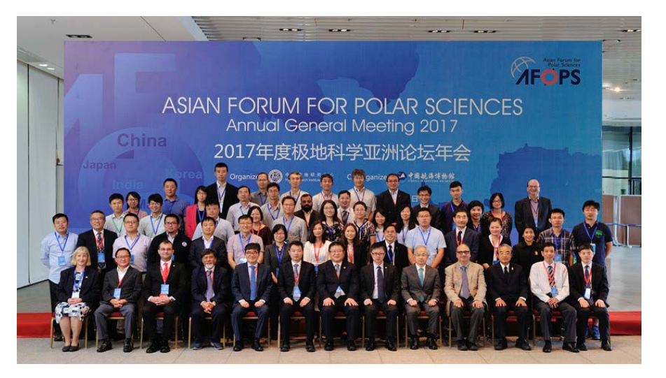
2017 AGM at Shanghai, China