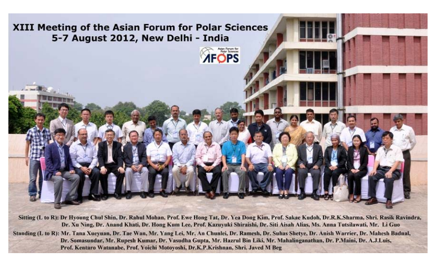
2012 AGM at New Delhi, India