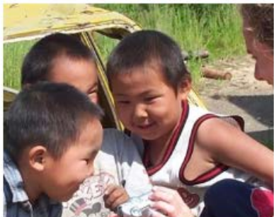
Health & Well-being