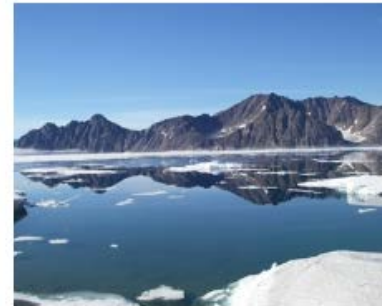
Glaciers & Sea-level