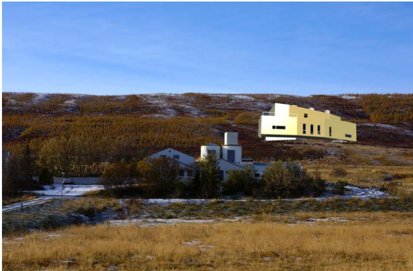
China-Iceland Arctic Research Observatory (CIAO) at Karholl, Iceland