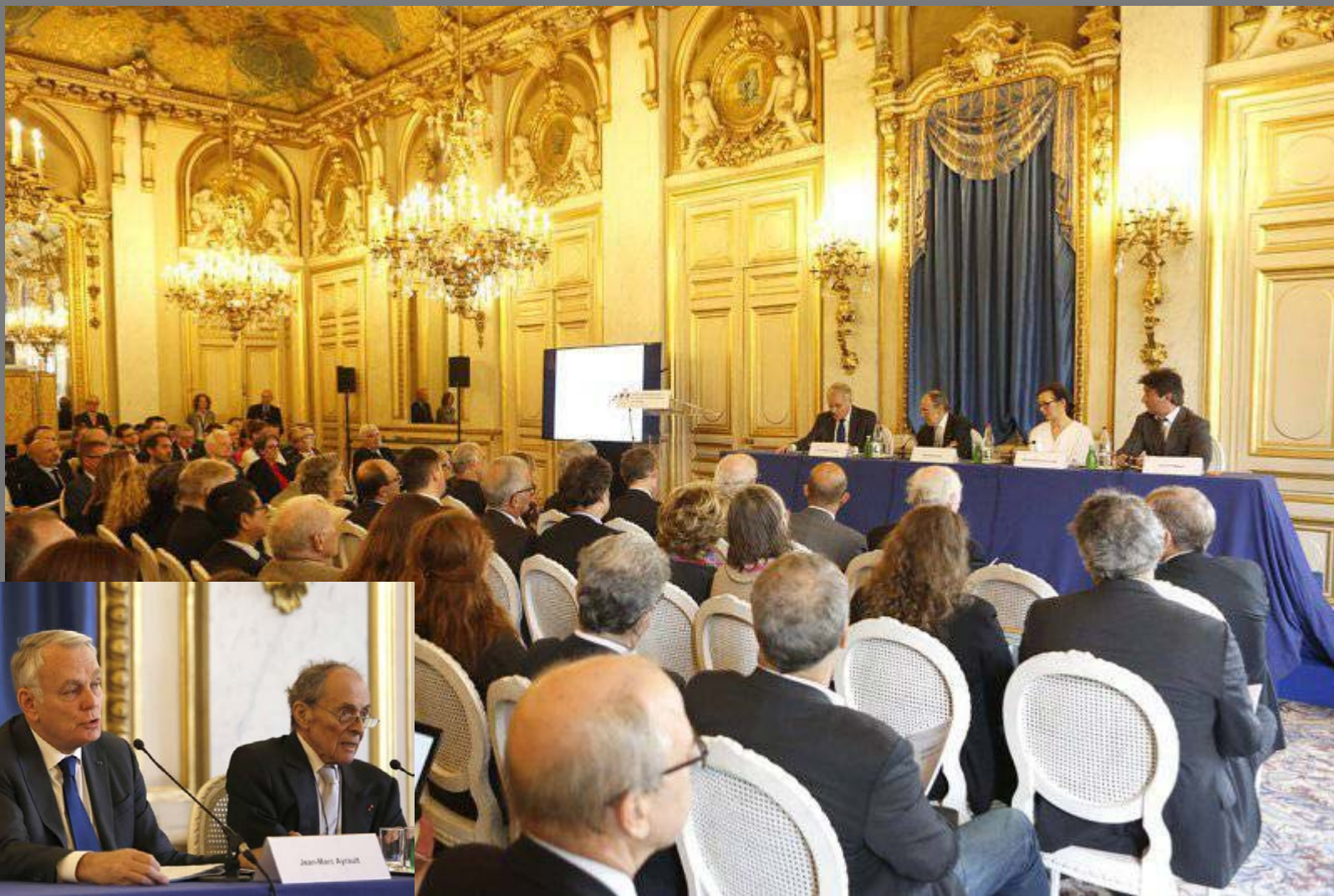
Minister of Foreign Affairs, Paris, 14 th June 2016