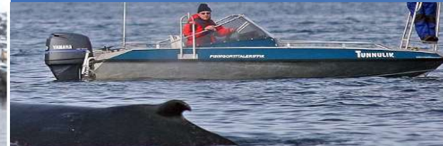
SANNA, Boats, Local providers