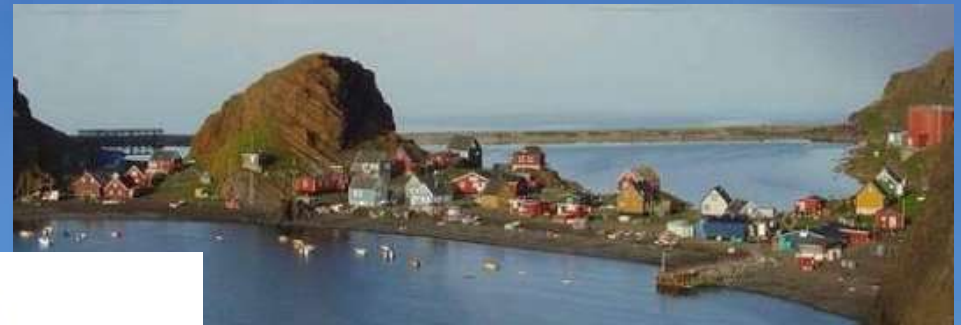
Niaqornat, Zackenberg, R/V (2021)