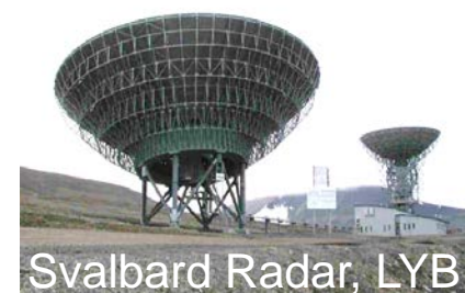
Svalbard Radar, LYB