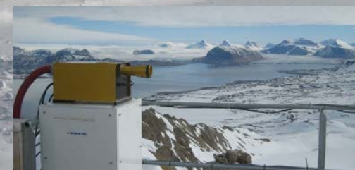
BC monitor at Mt Zeppelin