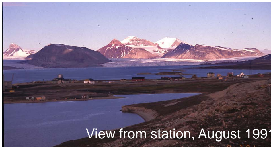
View from station, August 1991