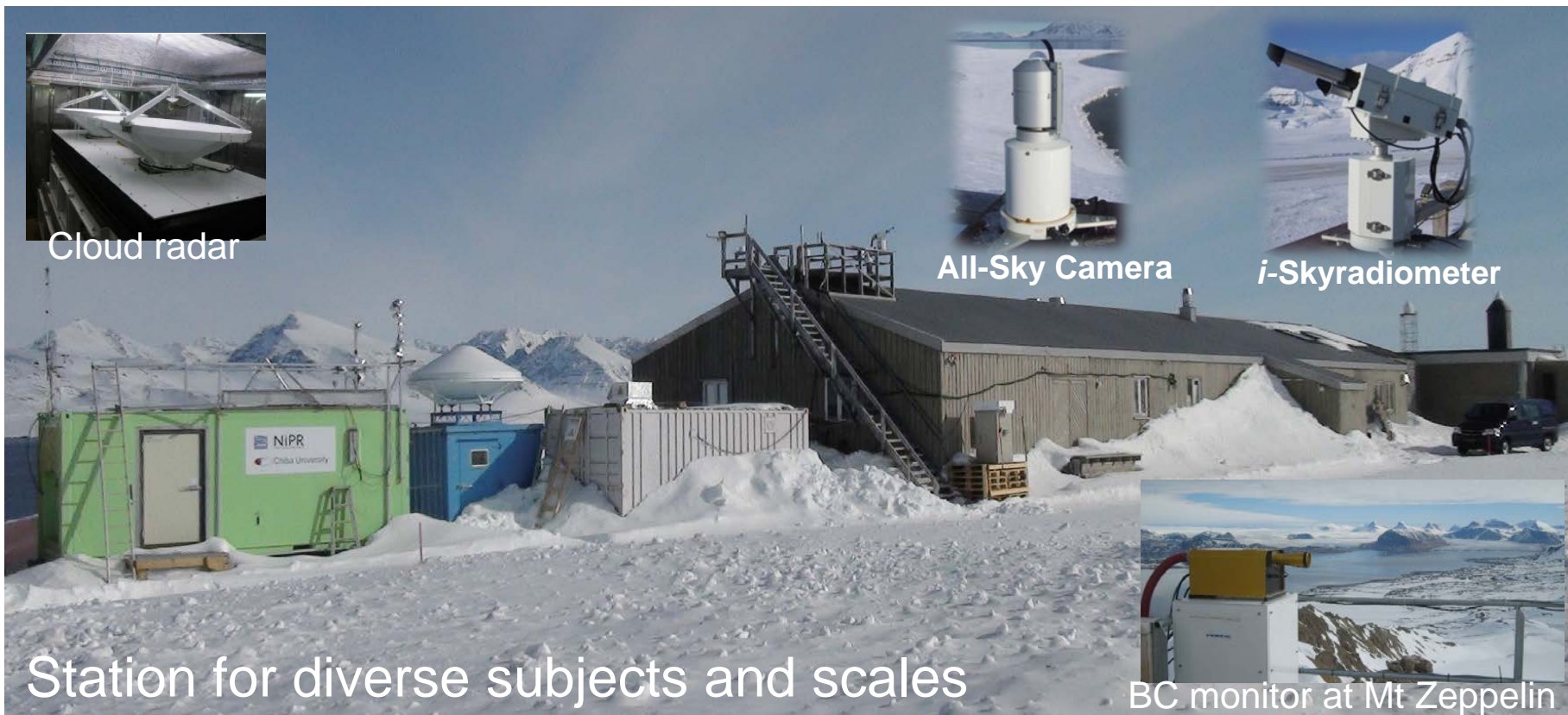
Station for diverse subjects and scales