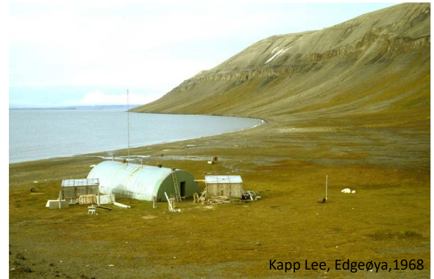
Kapp Lee, Edgeøya, 1968

Netherlands Scientific Expedition Edgeøya Svalbard