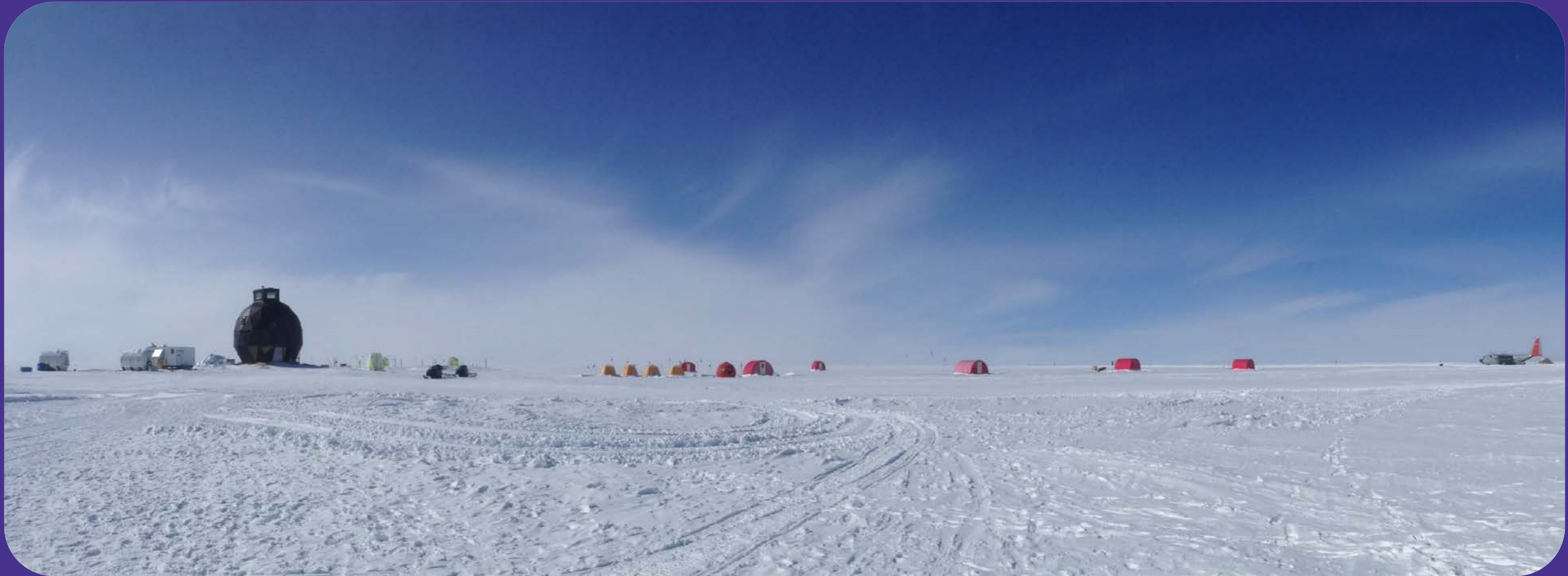
EASTGRIP Field camp