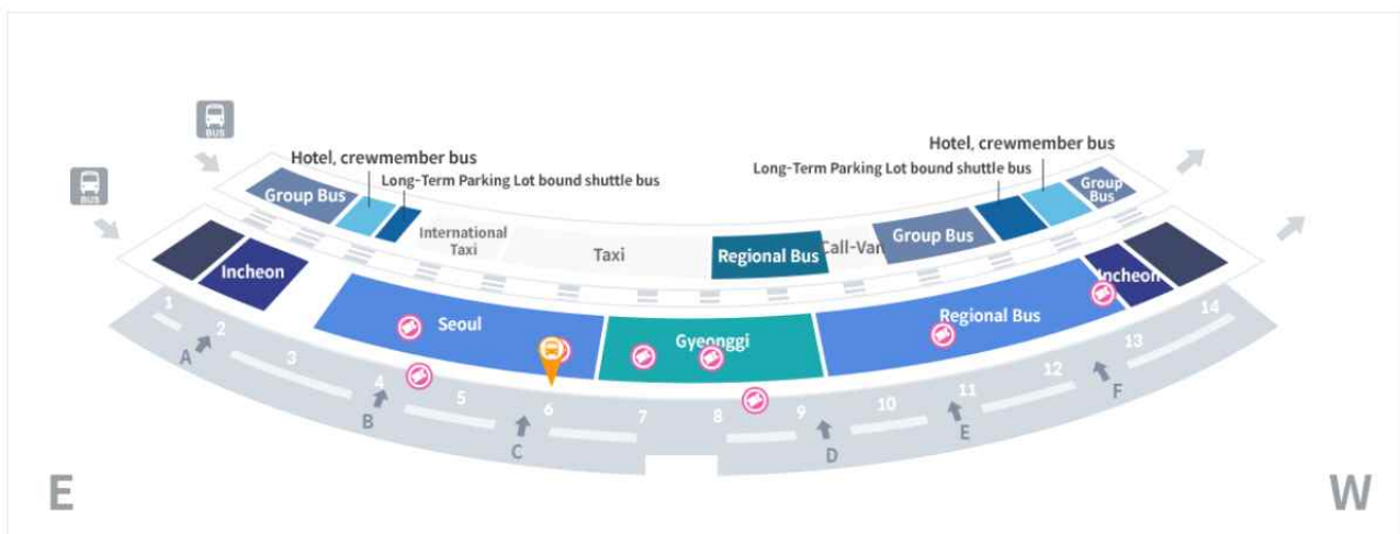
Terminal 1 Bus stop location